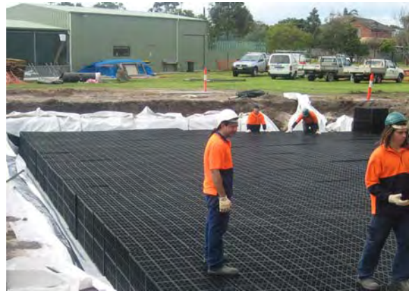
VersiTank® modules allow storm water to be stored and re-used for irrigation