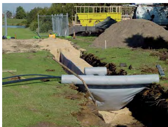
VersiTank® Infiltration System used in a trench application