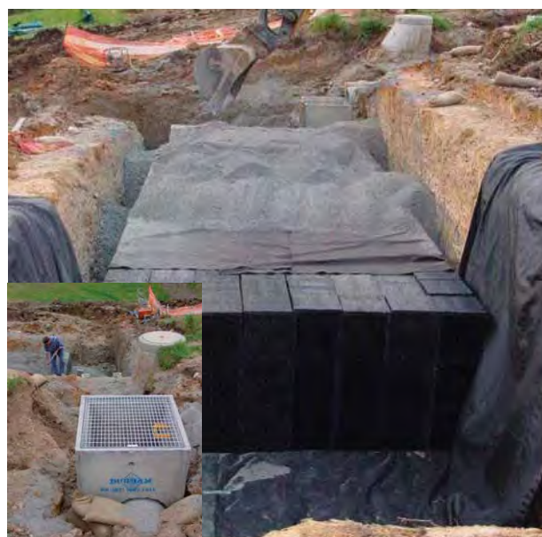
VersiTank® Infiltration System being installed

VersiTank® units may be enveloped in an impervious membrane to allow for the retention or temporary storage of stormwater, where soil conditions do not permit discharge into the surrounding soil. Stored water is released via a connected stormwater pipe incorporating a flow control valve, or re-used, subject to local environmental regulations.